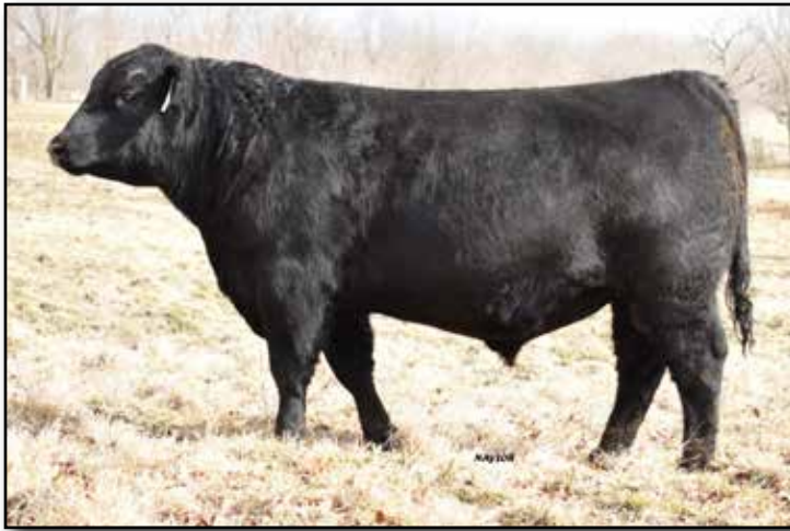
LOT 19 GPN Comrade 0N25