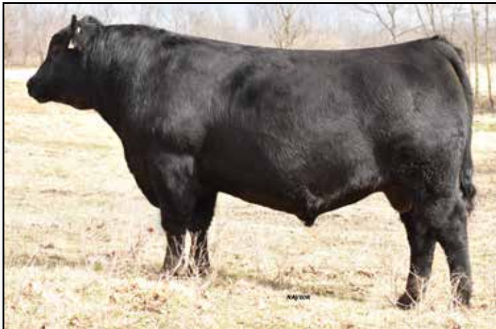
LOT 20 GPN Comrade 0N37

BW 66; ADJ. WW 720; ADJ YW 1360; PW ADG 4.00; ADJ YR FRAME 6.5