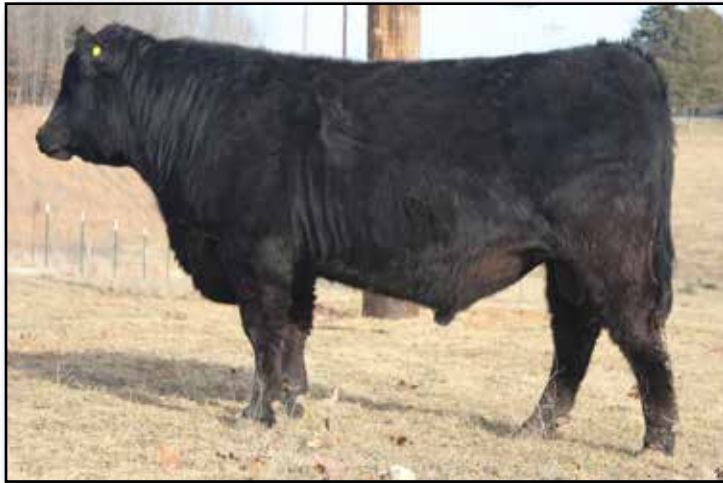
LOT 28 WRR Objective 089

BW 60; ADJ. WW 833; ADJ YW 1497; PW ADG 4.15; ADJ YR FRAME 7.2