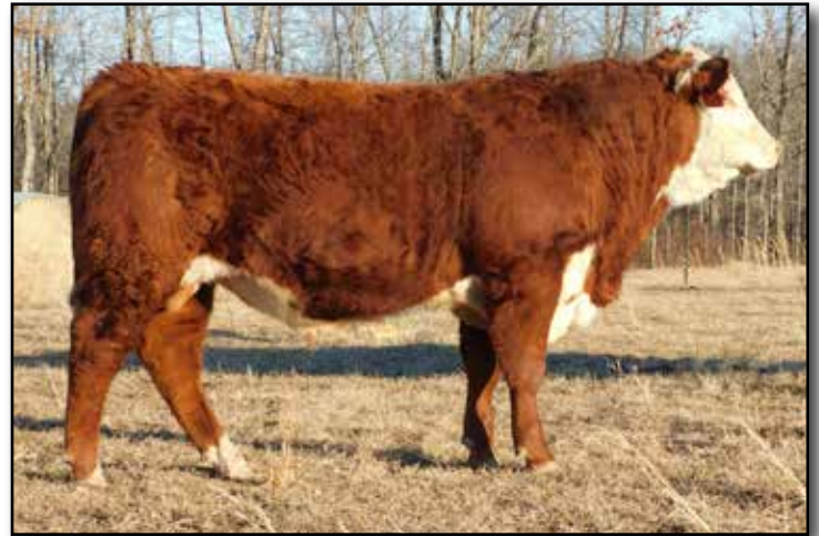
LOT 2 WPH MGW C555 Justice J105