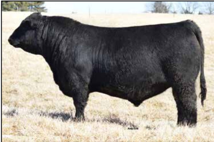
LOT 17 GPN Growth Fund 0N22

BW 78; ADJ. WW 777; ADJ YW 1429; PW ADG 4.08; ADJ YR FRAME 6.2