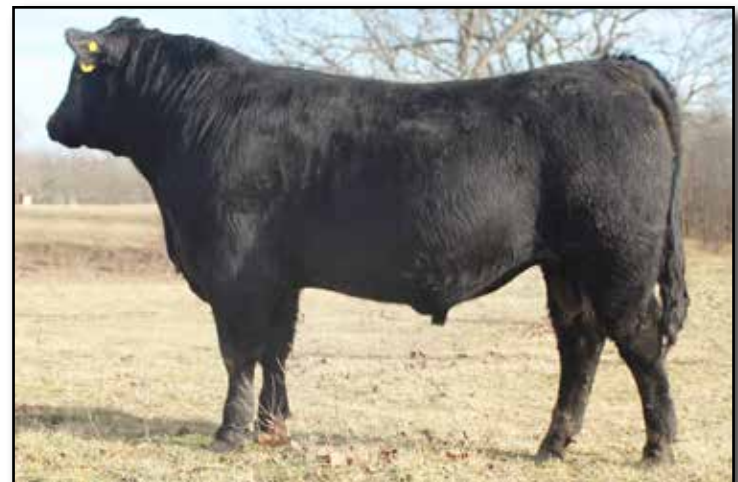
LOT 27 WRR Peyton 087

BW 67; ADJ. WW 847; ADJ YW 1434; PW ADG 3.67; ADJ YR FRAME 7.1