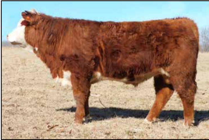
LOT 1 WPH MGW C555 Jones J101

BW 94; ADJ. WW 604; ADJ YW 1113; PW ADG 3.18; ADJ YR FRAME 6.0