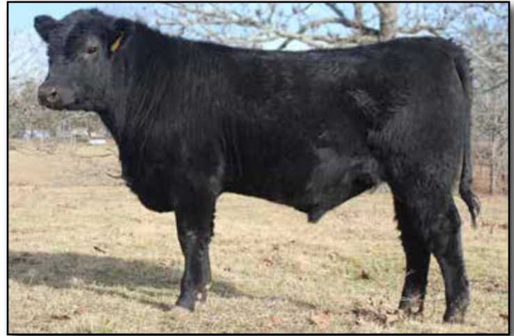
LOT 29 WRR Blk Onyx 109