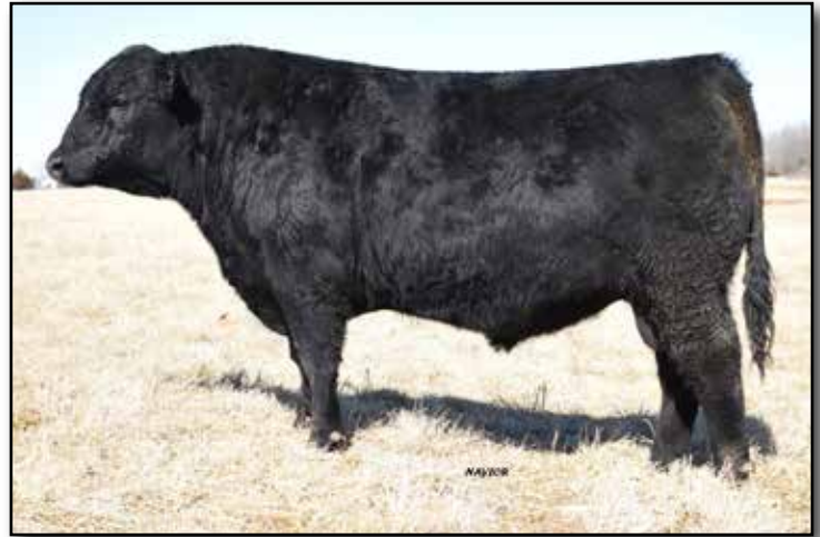
LOT 18 GPN Fortress 0N8

BW 77; ADJ. WW 774; ADJ YW 1392; PW ADG 3.86; ADJ YR FRAME 6.3