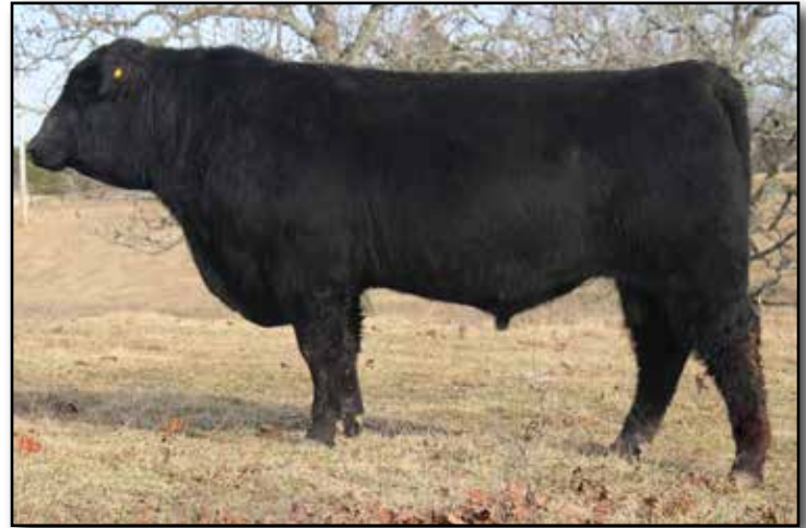
LOT 26 WRR Magnitude 042