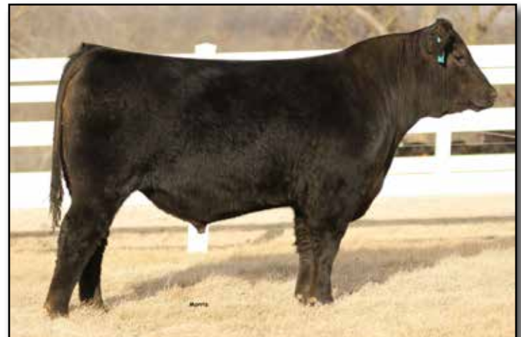
LOT 15 E-Lee Mayflower Apex 1804

BW 77; ADJ. WW 753; ADJ YW 1236; PW ADG 3.02; ADJ YR FRAME 6.0